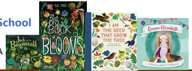
Key Text Bookshelf

Enquiry Question: How can we explore growing?