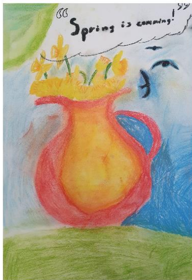
Spring Is Coming

https://artbytes.co.uk/schools/crayke-church-of-england-vc-primary-school-252/