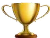
Apple, Beech & Year 4