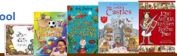
Key Text Bookshelf