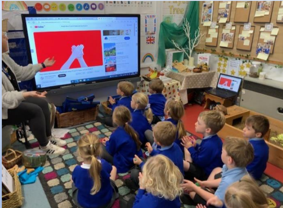
Apple – Dough Disco

A snapshot of learning from across the week... please use these photographs as an opportunity to talk to your children about what they have been learning!