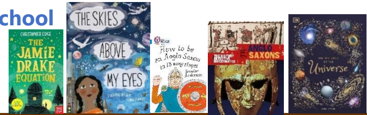
Key Text Bookshelf

Theme: Into the Darkness... Enquiry Question: What was it like to live in the Dark Ages?