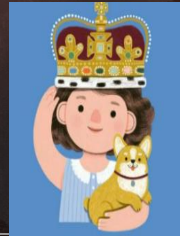
Queen Elizabeth II