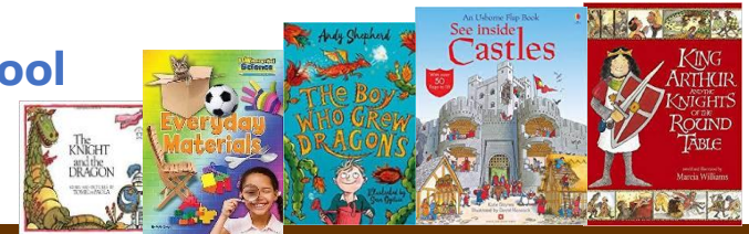
Key Text Bookshelf

Enquiry Question: How do people live happily ever after?