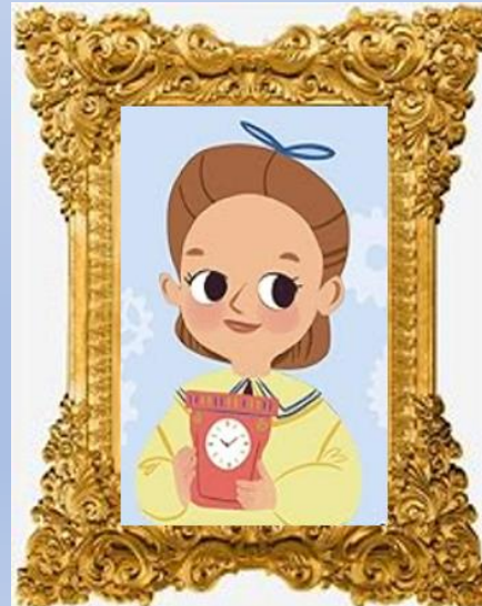
Corrie ten Boom