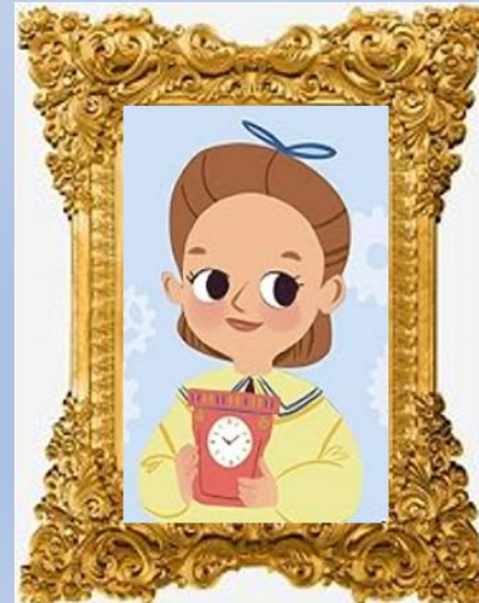
Corrie ten Boom