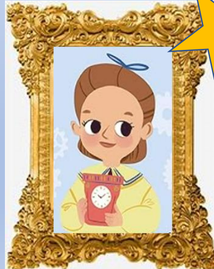
Corrie ten Boom