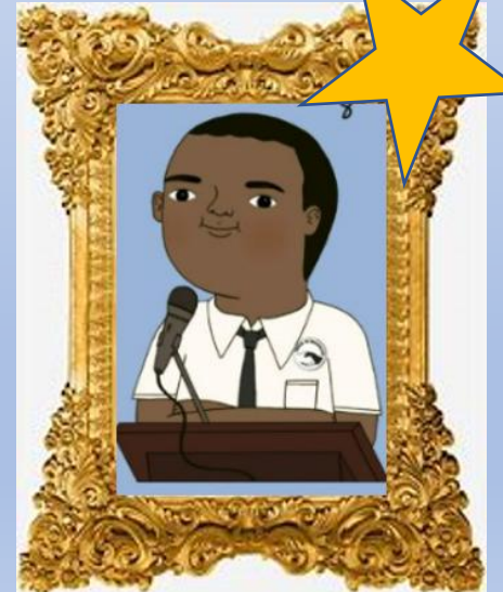
Martin Luther King Jr